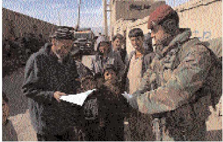
A British ISAF officer on patrol in Afghanistan