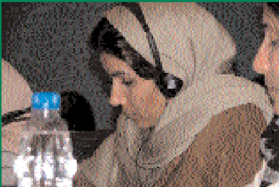
British Council project to train aspiring Afghan women politicians