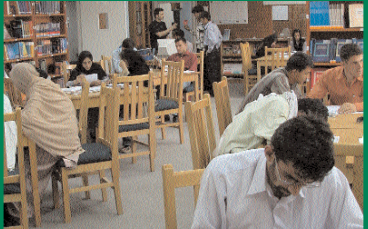
British Council funded resource centre at Kabul University