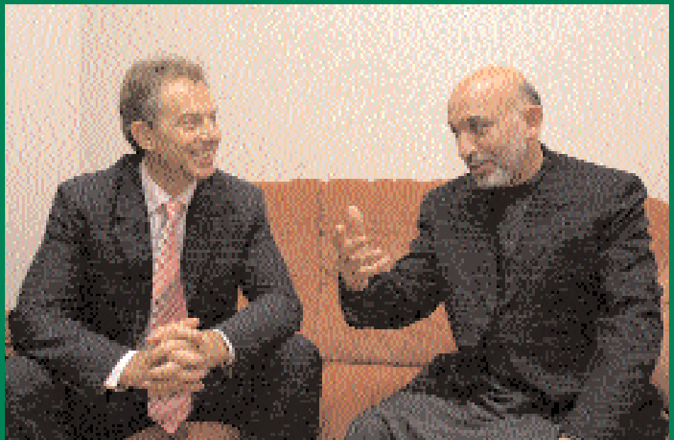
Prime Minister Tony Blair and HE President Hamid Karzai